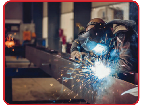
FR & ANTI-STATIC